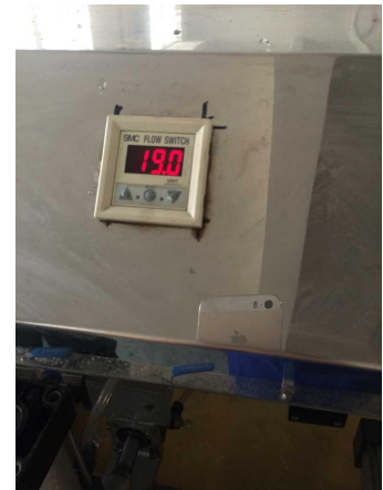
Diverter rate 19L/min