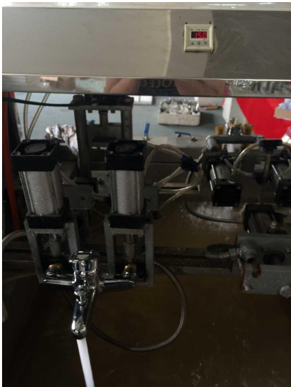
Aerator rate 15L/min