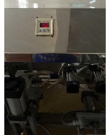
Aerator rate 15L/min